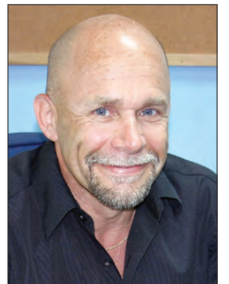
Krys staged another successful event.

The winning team - Beer Me - smashed the previous time out of sight, but it's no wonder because the six runners are all in the top dozen fastest individuals in the Cayman Islands.