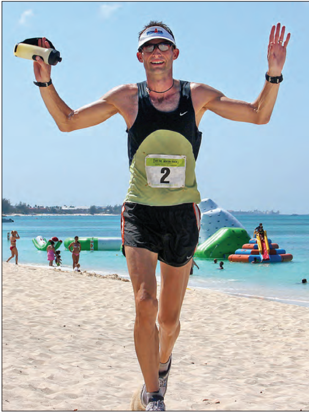
Ridsdale entered on a whim.