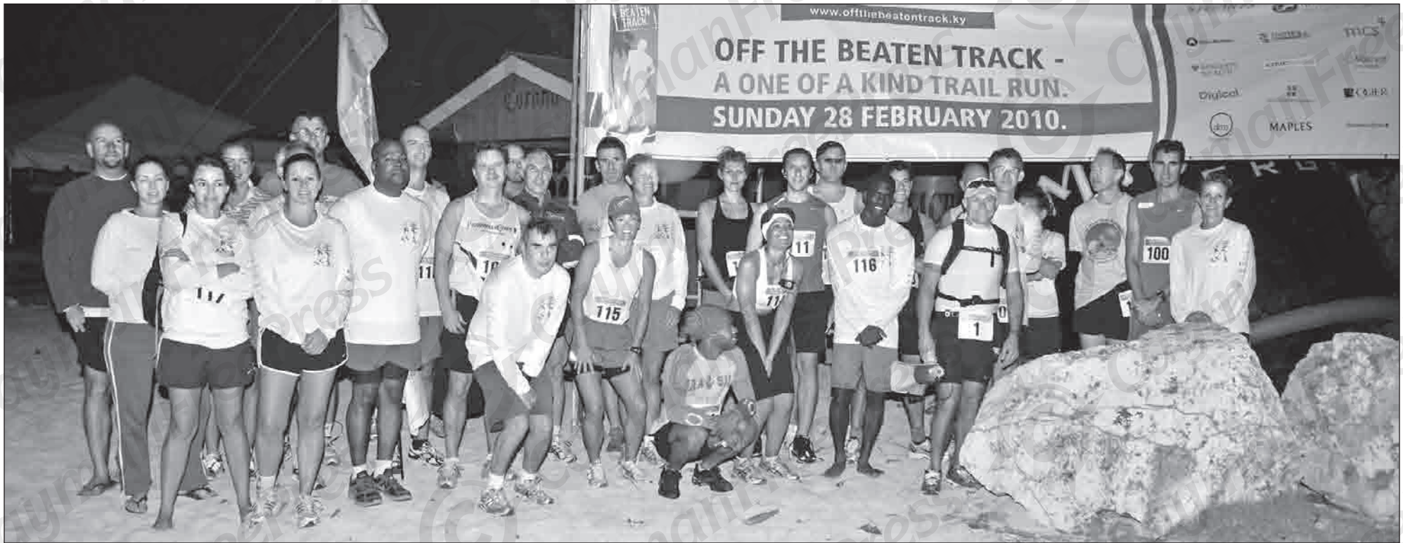
The first Off The Beaten Track event went well.